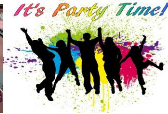
c) a party