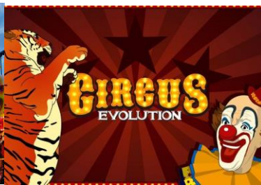
e) a circus