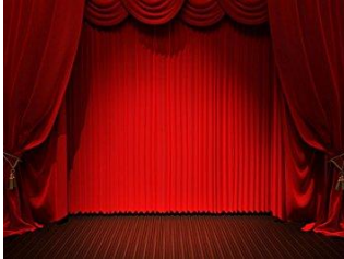
a) a stage