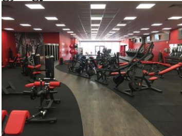
g) a gym