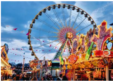
d) a funfair