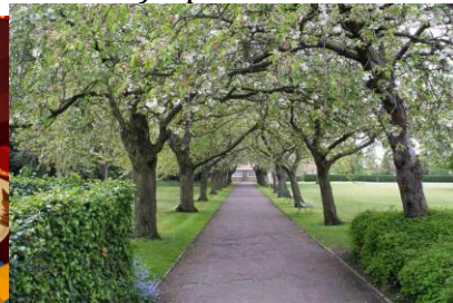
f) a park